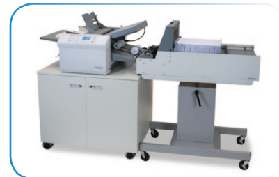
FD 38X in-line with optional V-Stack36

Formax - New Hampshire, USA www.formax.com